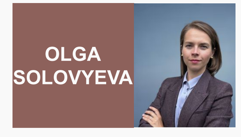
Lecturer in International Business and Technology, Regent's University London